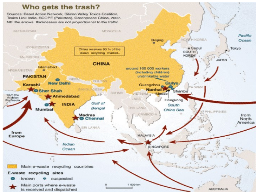
Figure 1 The routes of e-waste in Asia

Figure 1 is used to indicate main e-waste flows in Asia; however, no reliable data and figures available on how these transboundary e-waste routes are because currently the illegal and unregulated sector dominates the recycling industry in the industrializing countries (Widmer et al., 2005). As such, there are many obstacles revealed in safely and effectively processing electronic disposals.